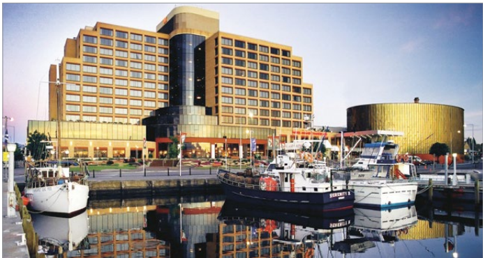
Hotel Grand Chancellor