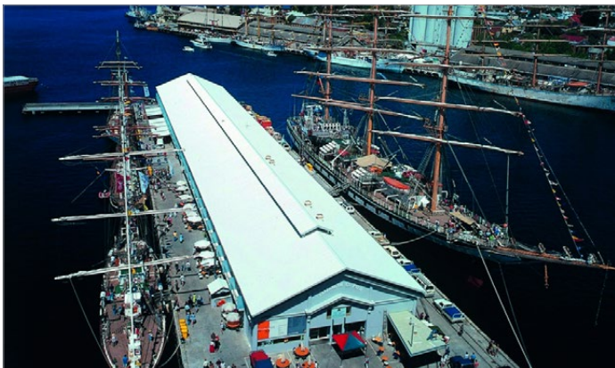
Hobart Function & Conference Centre