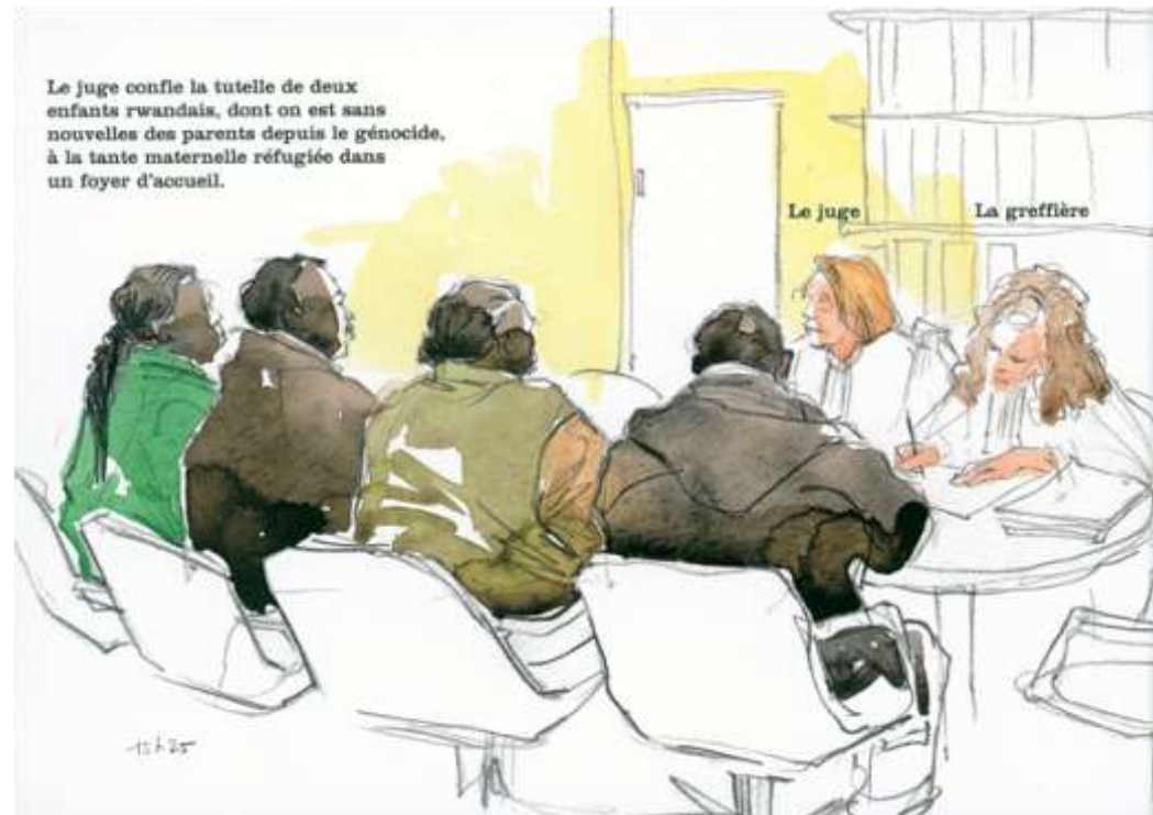
Palais de Justice, Paris Guardianship hearing