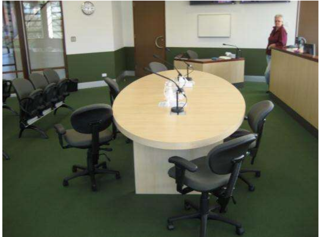
Collingwood Neighbourhood Justice Centre Lyons