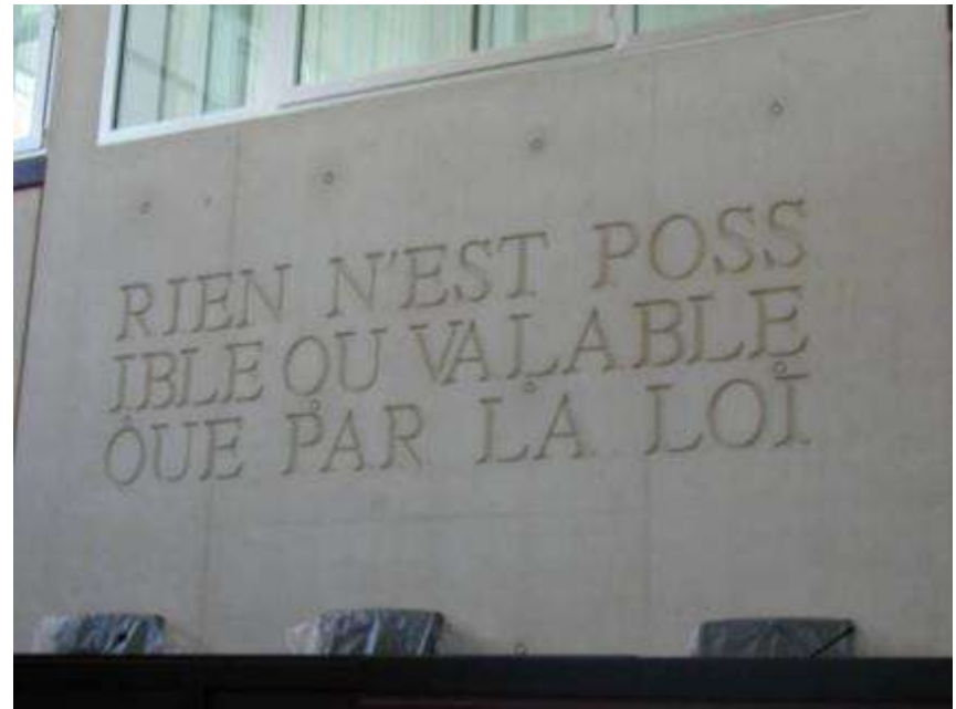
Palais de Justice, Pontoise