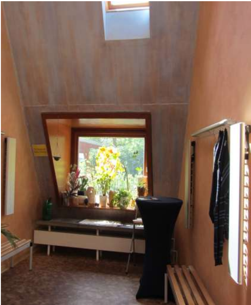
Steiner Social therapy workshop, Berlin-Brandenburg