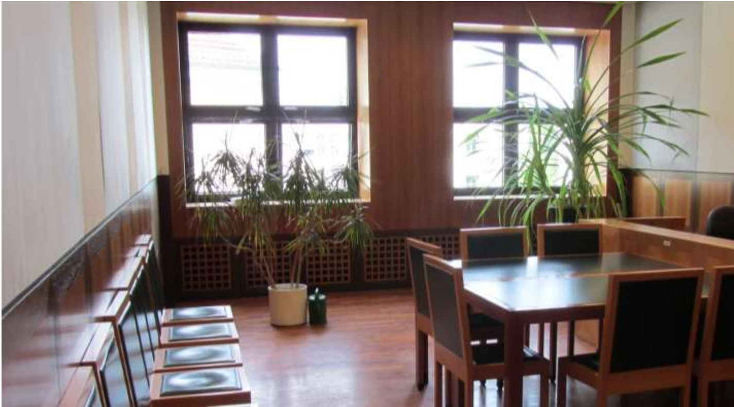
Familiengericht, Templehof-Kreuzberg, Berlin Architect: Oswald Mathias Ungers