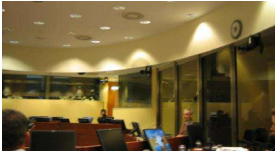
ICTY courtroom, The Hague