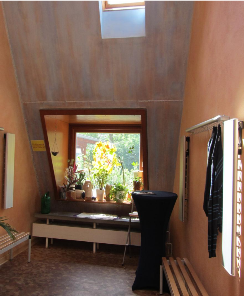
Steiner Social therapy workshop, Berlin-Brandenburg