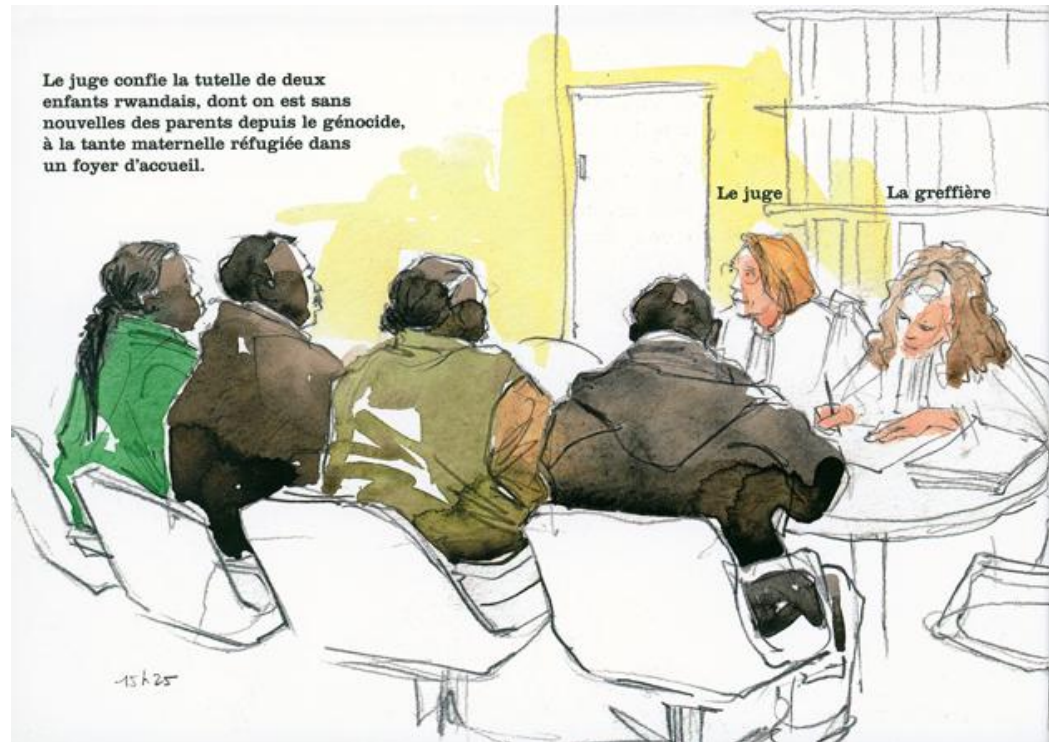
Palais de Justice, Paris Guardianship hearing