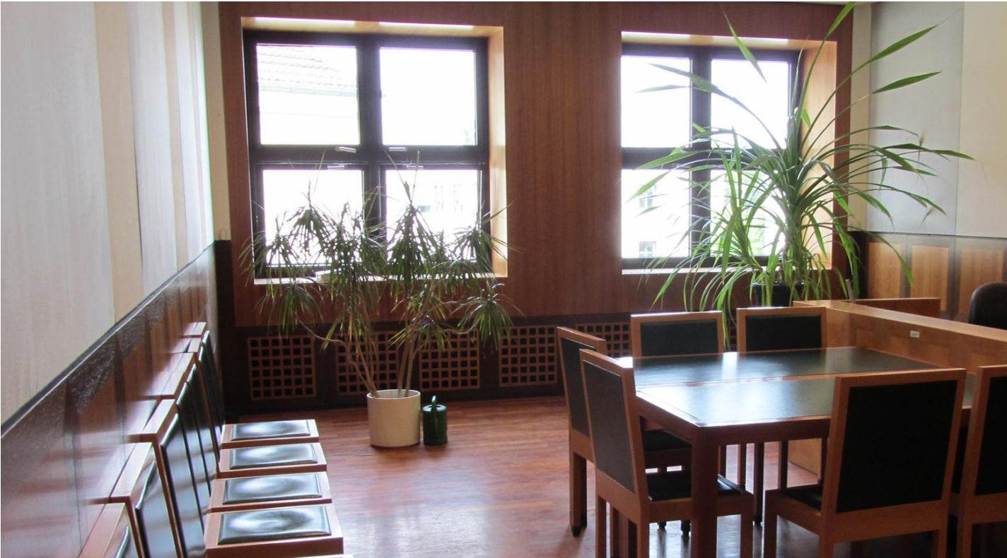
Familiengericht, Templehof-Kreuzberg, Berlin Architect: Oswald Mathias Ungers