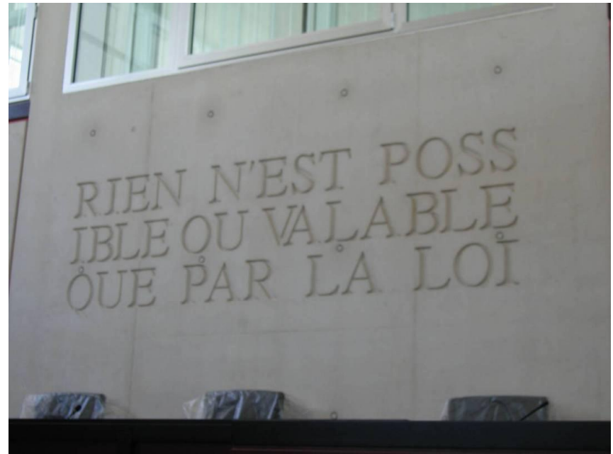
Palais de Justice, Pontoise