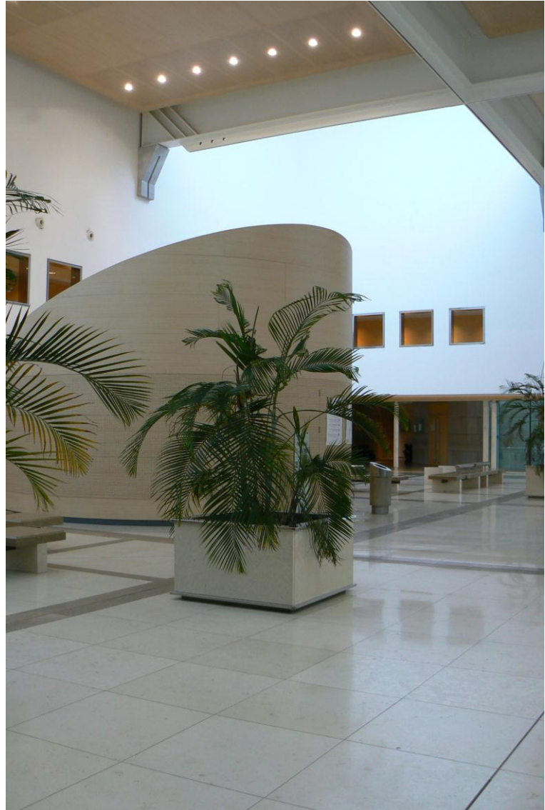
Avignon, New courthouse