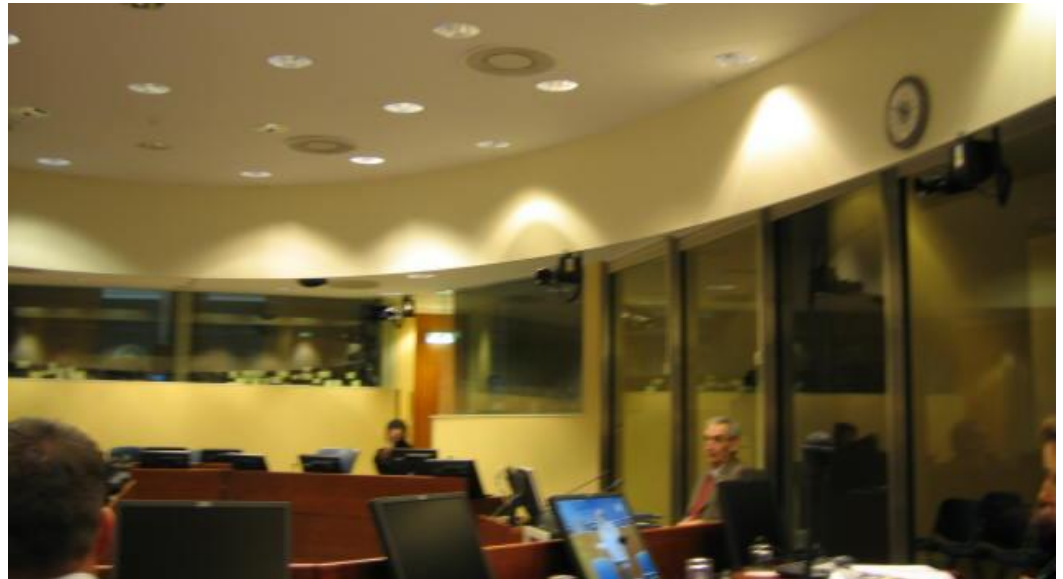
ICTY courtroom, The Hague